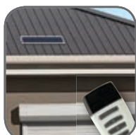
Remote Control With SolarSmart™ Automation 12V Motor