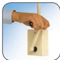
Steel Cable Winder (Up To 50Kg)