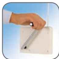
Cord Winder (Up To 20Kg)