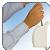
Strap Coiler (Up To 20Kg)