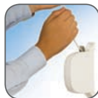
Cord Coiler (Up To 20Kg)