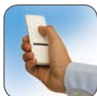
Remote Control With 240V Electric SIMU Hz Motor