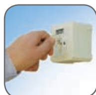
Key Switch With 240V Electric Motor