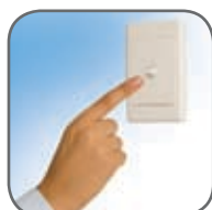
Wall Switch With 240V Electric Motor