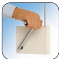
Strap Winder (Up To 20Kg)