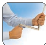
Crank Handle With 240V Electric Manual Override Motor

To place an order please complete the CW Products Made To Measure Roller Shutter Order Form available from your CW Products representative.