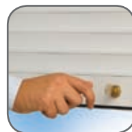
Spring Loaded With Key Lock