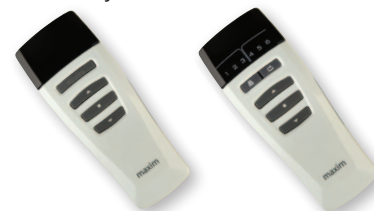
1 Channel Transmitter 6 Channel Transmitter

The PowerSmart™ system incorporates a built-in radio receiver that is compatible with the CW Maxim Radio Transmitter and is available in both 1 Channel and 6 Channel options. Both transmitters are powered by a 3 Volt Lithium button battery.